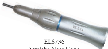
ELS736 Straight Nose Cone Retail $178