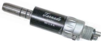
ELM744 Slow Speed Motor Retail $320