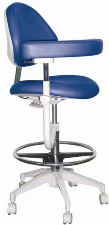
Assistant's Stool AS-1101