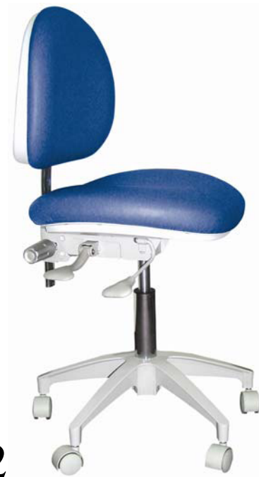
Doctor's stool DR-1102