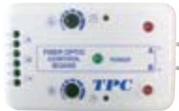
H 7020 Control Board