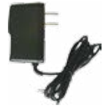
H 7090 Fiber Optic Transformer