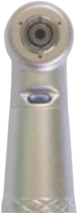
Fiber Optic w/Triple Water Spray