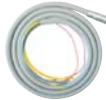
H 7045 Fiber Optic 6-Pin Tubing