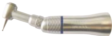
ELCA 760: Transmission 1:1, push button autochuck, for latch burs