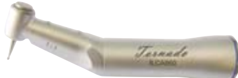
ILCA 860: Transmission 1:1, internal water spray, push button auto chuck for latch burs.