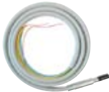
H 7040 Fiber Optic 5-Hole Tubing