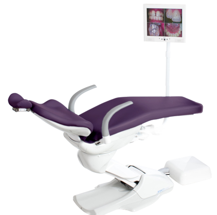
Model #4000 with LCD