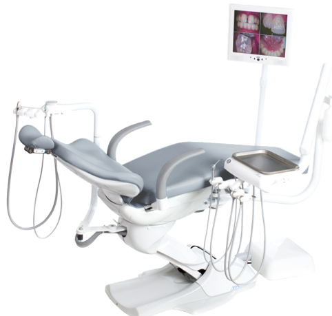
Model #MSP3500 with LCD