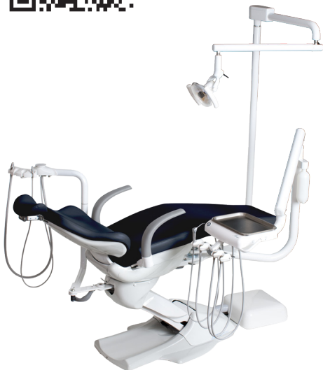
Model #MSP3500 with Dental Light