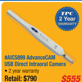
#AIC5899 AdvanceCAM USB Direct Intraoral Camera • 2 year warranty Retail: $790 $555