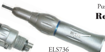
ELS736 Straight Nose Cone Retail $178 $125