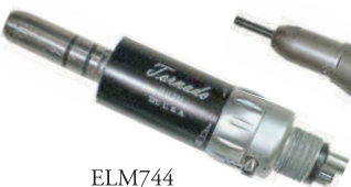
ELM744 Slow Speed Motor Retail $320 $225