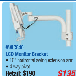
#WIC840 LCD Monitor Bracket • 16" horizontal swing extension arm • 4 way pivot Retail: $190 $135