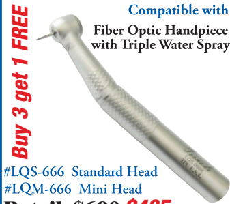
Fiber Optic Handpiece with Triple Water Spray

Compatible with 3 types of Fiber Optic Couplers