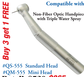
Non-Fiber Optic Handpiece with Triple Water Spray

Compatible with 3 types of Non Fiber Optic Couplers