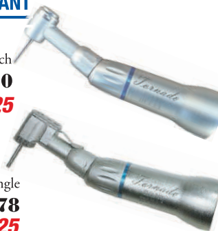
ELCA760 Push Button Latch Retail $320 $225 ELCA762 Latch Contra Angle Retail $178 $125