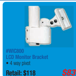
#WIC800 LCD Monitor Bracket • 4 way pivot Retail: $118 $83