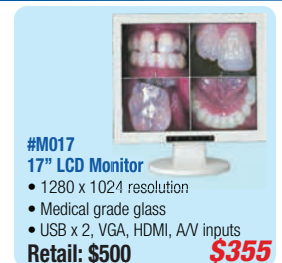
#M017 17" LCD Monitor • 1280 x 1024 resolution • Medical grade glass • USB x 2, VGA, HDMI, A/V inputs Retail: $500 $355